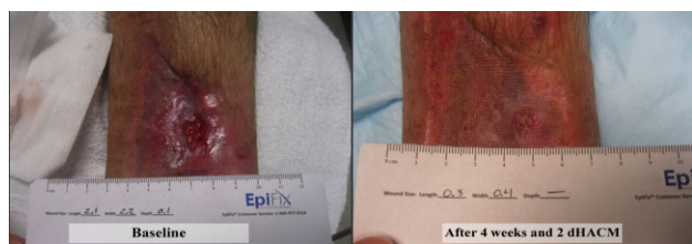
Figure 3. Case example of healing between baseline observation and 4-week study endpoint for one patient receiving dHACM.

randomization and the 4-week visit. In the 4-week study period, six patients in the dHACM group and four patients in the MLCT group had complete wound closure. Examples of wound closure during the 4-week study period for patients receiving dHACM are presented in Figure 3.