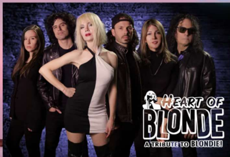
MC - MALLERY