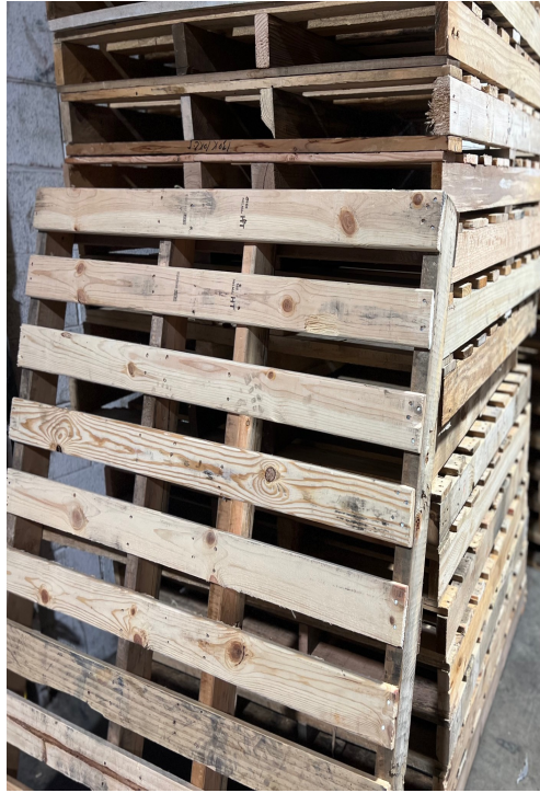
48 X 48 Pallet

Our 48 X 48 and 36 X 36 are one of our most frequently ordered pallets. They can be either built from scratch or refurbished depending on our client requirements.