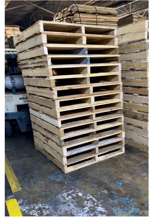
36 X 36

Our 48 X 48 and 36 X 36 are one of our most frequently ordered pallets. They can be either built from scratch or refurbished depending on our client requirements.