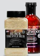
SPICES & SAUCES