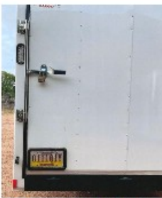
Two Stolen Trailers - NM Tags # 011100 & # 011101