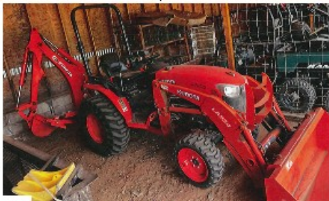
NM Fire Equip Stolen 6/7-6/8/25