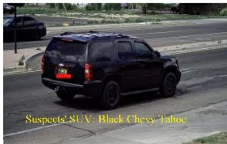
Suspects' SUV: Black Chevy Tahoe