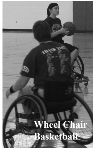
Wheel Chair Basketball