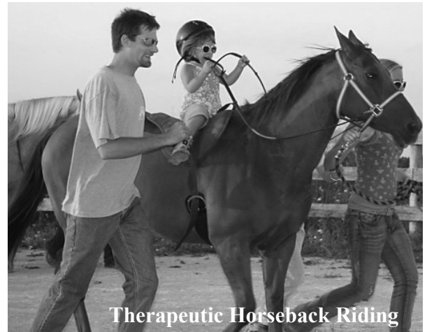
Therapeutic Horseback Riding