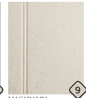
MACADAMIA Shown above on Oak Available in these wood types: MO/O