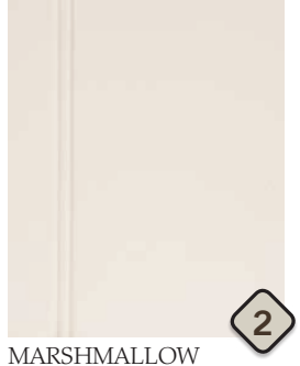
MARSHMALLOW CREAM Shown above on Maple Available in these wood types: