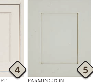
FARMINGTON Available in these wood types: A/C/H/L/M/O/Q/△A/W