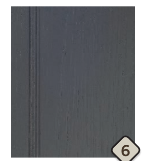
PEPPERCORN Shown above on Oak Available in these wood types: M/O/Q