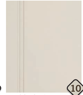
REPOSE GREY Shown above on Maple Available in these wood types: MO/O