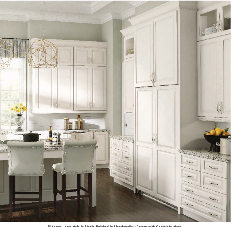
Ridgeway door style in Maple finished in Marshmallow Cream with Chocolate glaze