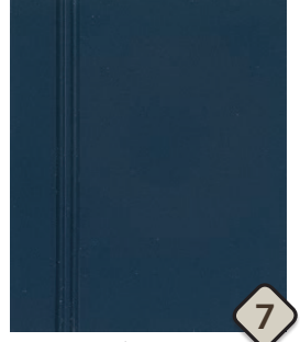
BLUEBERRY Shown above on Maple Available in these wood types: M/O/Q