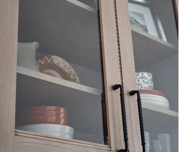
GLASS DOOR INSERTS