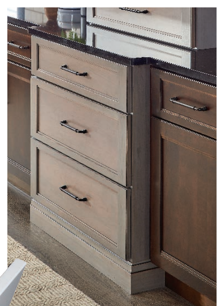
THE FIVE PIECE DRAWER HEADER IS JUST ONE WAY TO DRESS UP YOUR CABINETRY DRAWERS.

To see all the available door styles, wood types, colors, distressing techniques and accents, visit your Fieldstone Cabinetry dealer's showroom and ask for the Colors, Styles & Accents brochure.