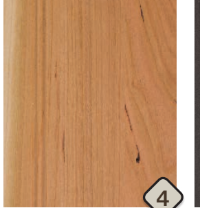
NATURAL Shown above on Cherry Available in these wood types: A/C/H/M/O/Q/△A/△C/△H/W