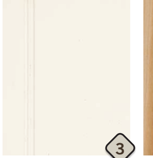
DOVE Shown above on Oak Available in these wood types: M/O/Q