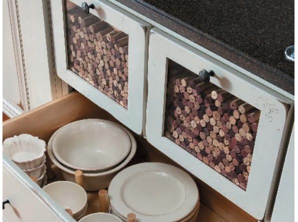
MULLION DOORS DECORATIVE STORAGE

Most doors and drawers can be personalized with mullions, decorative panels and much more. Just a tiny sampling of the options available are illustrated here. There are hundreds more, so be sure to ask about your options to make your cabinetry all yours!