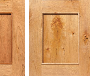
OSWEGO Available in these wood types: A/C/H/M/O/\triangleA