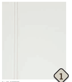
WHITE Shown above on Maple Available in these wood types: M/O/Q