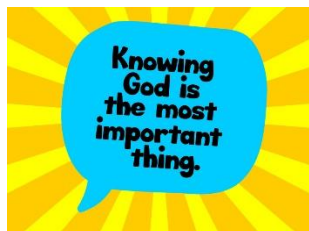
Bottom Line 1