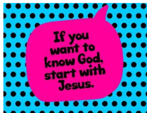
Bottom Line 2