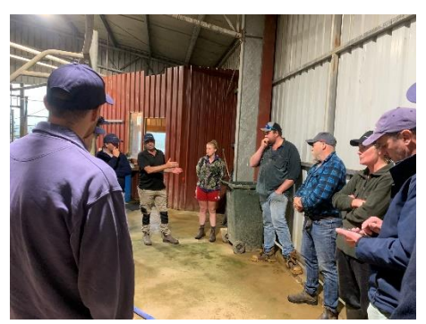
CONTINUED PAGE TWO...