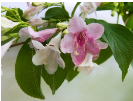
Sarcococca ruscifolia var. chinensis L713 (top) and Weigela 'Conquete'.

The Gardens hold three National Plant Collections - Diervilla , Sarcococca and Weigela - and the Friends have long been involved in their management.