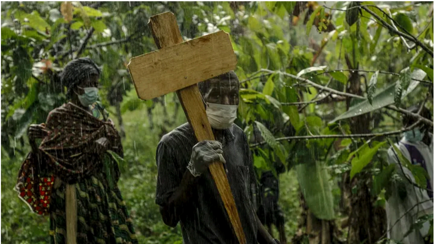
A volunteer holds a cross as a family member follows under heavy rain during a burial ceremony in Ntoyo, Sept. 10, 2025. Terrorists linked to the Islamic State group killed at least 89 people in an overnight attack at a funeral event and in nearby villages in eastern Democratic Republic of Congo, local and security sources said.