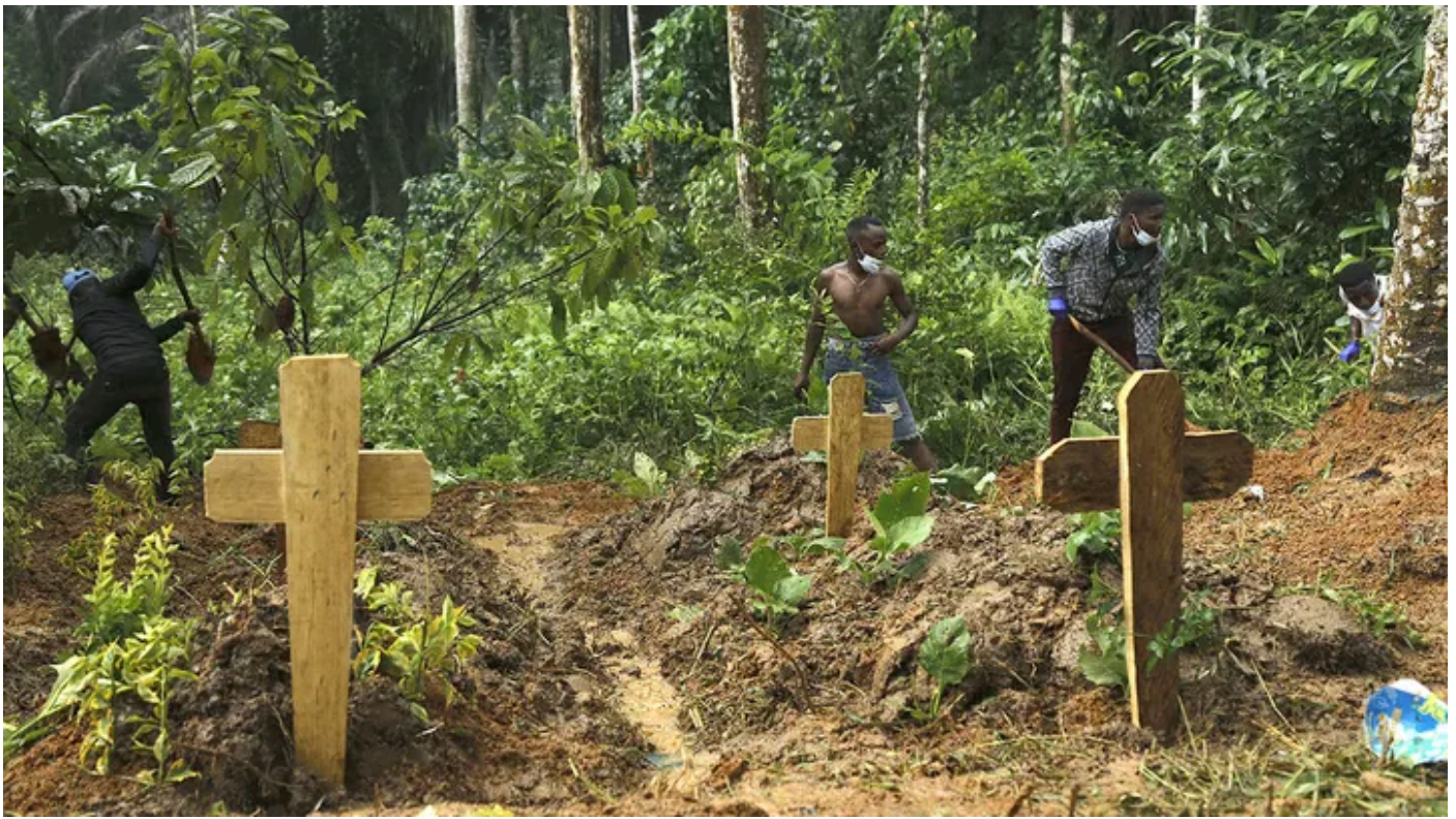
Crosses are seen as volunteers dig graves for the victims of an attack during a burial ceremony in Ntoyo, Sept. 10, 2025. Terrorists linked to the Islamic State group killed at least 89 people in an overnight attack on a funeral event and in nearby villages in eastern Democratic Republic of Congo, local and security sources said.