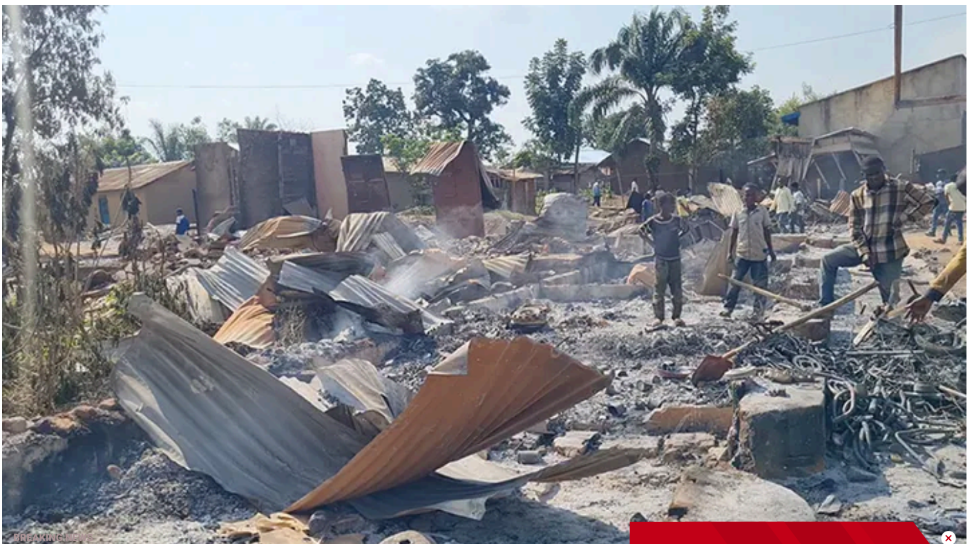
BREAKING NEWS WATCH LIVE: Trump confirms Charlie Kirk suspect in custody A screenshot shows villagers inspecting the damage left by jihadist terrorists who killed 49 Christians in DRC Congo in July. (Open Want to get these alerts sent to you directly? Click here.

Following last month's attack, a White House spokesperson told Fox News Digital, "The Trump administration condemns in the strongest terms this horrific violence against Christians in the DRC and is committed to advancing the Washington Accords to bring peace back to the region and end targeted killings."