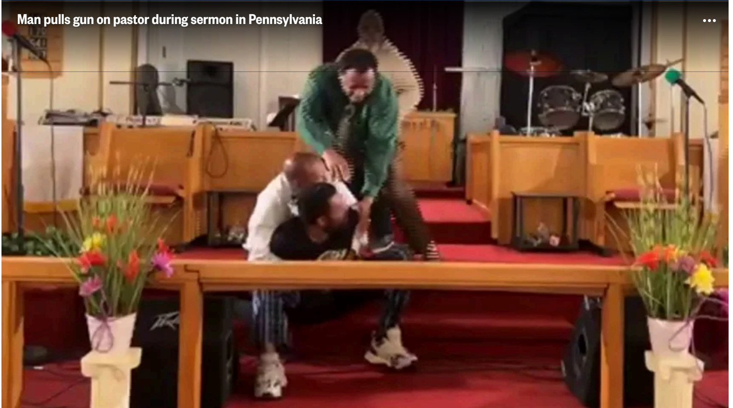
Man pulls gun on pastor during sermon in Pennsylvania