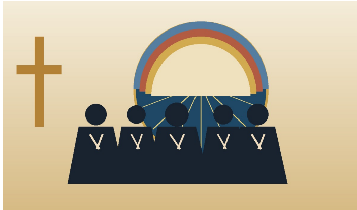
Original WAJD-style illustration: believers praying while the nation faces confusion.