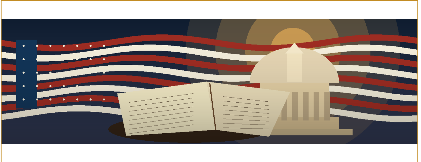
Original WAJD illustration: Bible, Capitol, and flag imagery for commentary purposes.

A WAJD biblical commentary on nation, government, identity, and the believer's true citizenship in Christ.