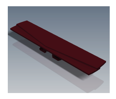
Slat belt with stainless steel roller chain