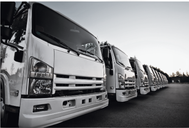
Shipping/Receiving and Supply Chain