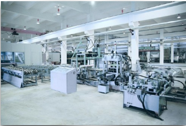
Process Flow/Labor Tracking