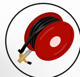
Fire Hose Reel