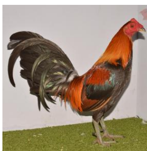
2025 Winner Hall Family

Best of Breed Prizes kindly donated as follows: