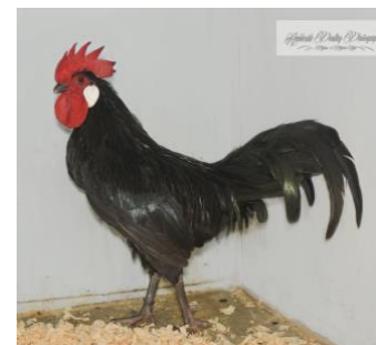
2023 Winner Kevin Stoodley

Best Ancona Bantam - $10 Ambleside Poultry Photography Best Andalusian Fowl or Bantam - $10 Ambleside Photography Best Aracauna Bantam - $10 SAPA Best Leghorn Bantam - $20 In memory of Ian Holden Best Hamburg Fowl or Bantam - $10 DTMA Poultry Best Polish Fowl or Bantam – $10 Lobethal Poultry Club Best Minorca Fowl or Bantam - $10 Country to Coast Cleaning Best Spanish Fowl or Bantam - $10 SAPA