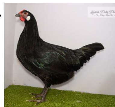
2023 Winner Hall Family

Best Ancona Fowl - $10 Ambleside Poultry Photography Best Andalusian Fowl or Bantam - $10 Ambleside Photography Best Araucana Fowl - $10 Noble Family Best Leghorn Fowl - $10 In memory of Les Goodwin Best Hamburg Fowl or Bantam - $10 DTMA Poultry Best Minorca Fowl or Bantam - $10 Country to Coast Cleaning Best Polish Fowl or Bantam – $10 Lobethal Poultry Club Best Silkie Fowl - $20 Chicks of Chandon Reserve Silkie Fowl - $10 Chicks of Chandon Best Spanish Fowl or Bantam - $10 SAPA Best Welsummer Fowl - $10 DTMA Poultry Best Vorwerk or Lakenvelder Fowl - $10 Kevin Stoodley Best AOV Light Fowl - $10 SAPA