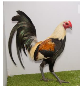
2023 Winner TNJ Poultry