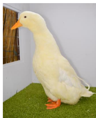
2023 Winner Jenny Colley

Best Cayuga - $10 Fleurieu Poultry Club Best Muscovy – $15 DTMA Poultry Best Pekin - $10 Peter Button Best Rouen, Blue Swedish or Watervale - $10 SAPA Best Silver Appleyard Large or Bantam - $10 SAPA Best Saxony Large or Bantam - $10 SAPA