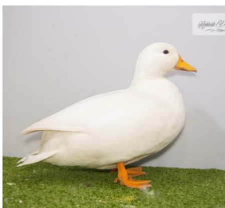
2023 Champion Riddle Kids