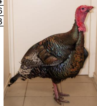
2023 Winner JAKTS Poultry

Best Turkey – $20 Estate & Succession Lawyers Best Jungle Fowl - $10 SAPA Best Guinea Fowl - $10 Fleurieu Poultry Club