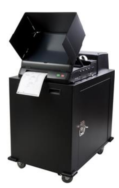
Figure 2. ImageCast Evolution (ICE) with ballot box