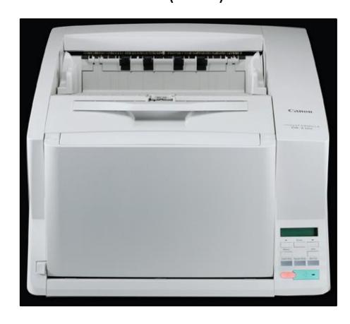
Figure 4. ImageCast Central tabulator (ICC) (model Canon DR-X10C shown)

• The central count scanners are the ImageCast Central (ICC) tabulators (Figure 4). These systems use commercial-off-the-shelf (COTS) hardware with Dominion software.