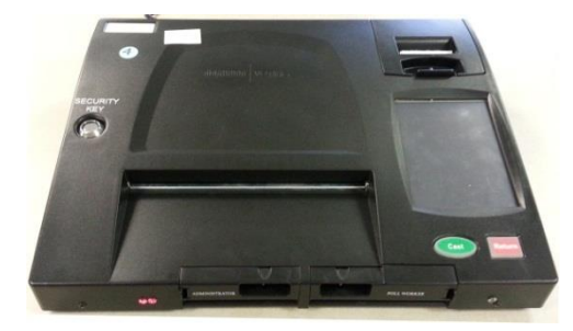
Figure 1. ImageCast Precinct tabulator (ICP)

ImageCast Precinct (ICP) tabulator is an optical scanner with ballot review. The ICP is attached on a ballot box (Figure 1, ICP only). When configured with audio ballots, the ICP is an accessible voting device (ICP-A).