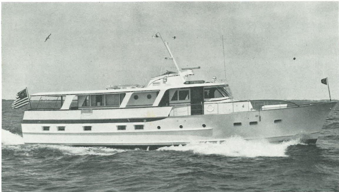
First of the new Burger 68' in a houseboat design