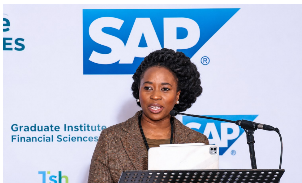
Global Business Leaders from SAP and the Future of Jobs Stakeholders

"The future of jobs is not just about economics. It is about whether we are building a society in which people are able to imagine futures for themselves again.