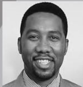
Ndaba Mandela Deputy Chairperson of the African Youth Parliament AFRICA RISING FOUNDATION