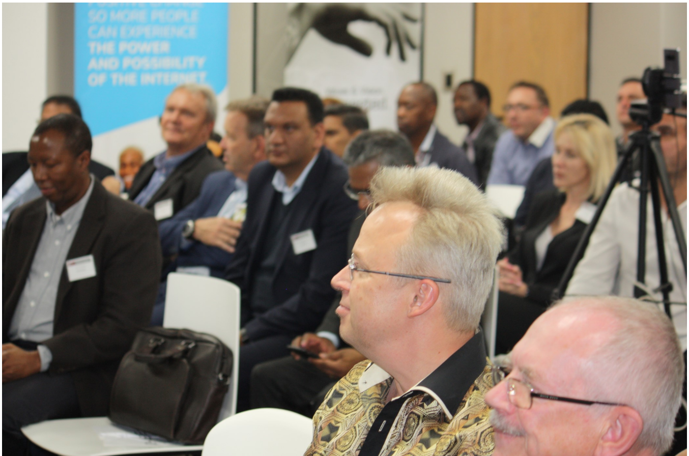
The Future of Technology Conference 2018 (brought to you by the ITA) - Audience listening attentively to the Opening Plenary

The Information Technology Association (ITA), founded in 1934, merged with the IT Users Council in mid-2000, is the official trade and employer body of the Information Technology Industry in South Africa. The ITA represents more than 200 companies concerned with the supply of information technology equipment, systems, software and services. Prominent members include Microsoft, IBM, SAP, BCX, EOH and ALTRON. More information at www.ita.org.za