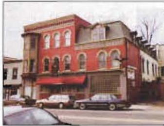
#48 520-522 Main St. Kaufman House Eclectic Style, 1879.