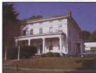
#5 208 Third St. Judge Ulysses Mercur House Greek Revival, 1851.