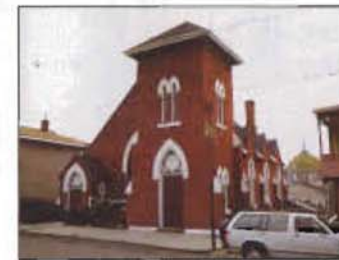
#42 305 Second St. Universalist Unitarian Church Gothic Revival, 1877.