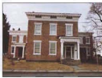
#2 100 River St. (now Merrill Pkwy). Canal House, early 1800's.