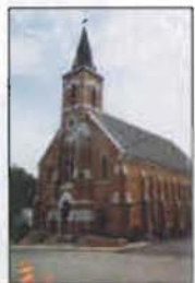
#43 1 Third St. STS. Peter and Paul Church Gothic Revival, 1879.