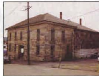
#38 109 Pine St. Old Bradford County Jail Italianate Style, 1873.