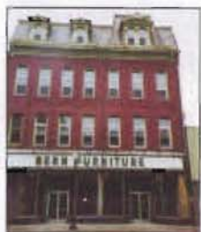
#13 416 Main St. Second Empire Style, 1880. Destroyed by fire in 2006.