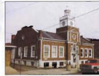
#33 10 Park St. Townanda Borough Hall Colonial Revival, 1934.