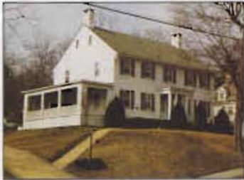
#34 1 York Ave. Towanda's Oldest House Federal Style, 1812.