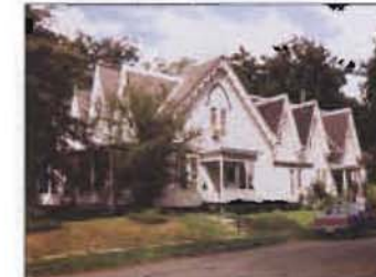
#9 200 Chestnut St. Gingerbread House Victorian, mid 1800's.