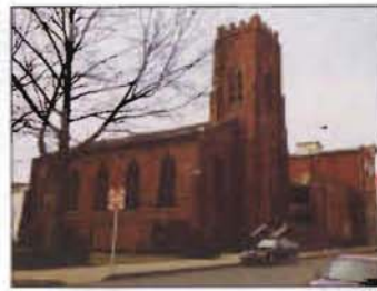
#32 5 Court St. First Presbyterian Church Gothic Revival, 1855.