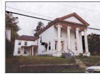
#3 14 Second St. Mahlon C. Mercur House Greek Revival, 1835.