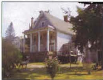
#10 227 Poplar St. David Wilmot House Gothic Revival