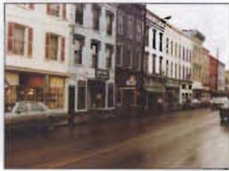
#7 401 thru 429 Main St. Italianate Style, 1855 thru 1875.