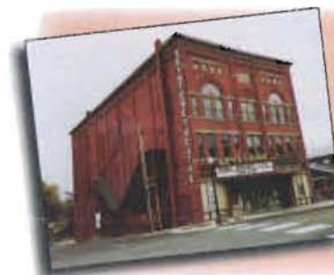
#15 601 Main St., Keystone Theatre, Romanesque Revival, 1886. Originally the Hale Opera House where John Phillip Sousa's Band performed. First floor once a railroad station for Southern and New York Railroad. In 1913 renamed and transformed into present 'movie house'.