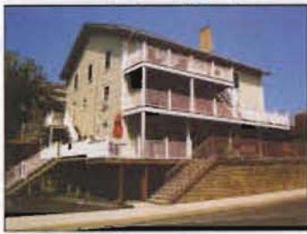
#31 1 Bridge St. American Hotel Greek Revival, early 1800's.