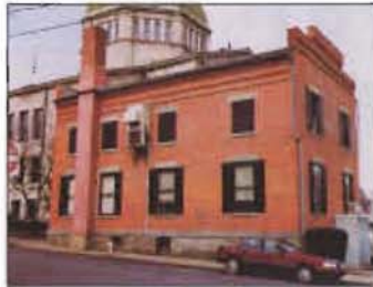
#47 Court St. Courthouse Annex Italianate Style, 1857.