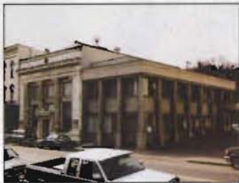
#37 History of 312 Main St. Classical Revival, 1909.