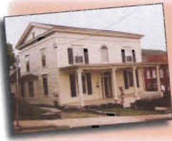
#1 110 Bridge St., William Means House, Greek Revival, 1816. Occupied continuously for 129 years by the Means family. Architectural features: Fluted ionic porch and entrance columns; swag and garland carved window head; color glass window.