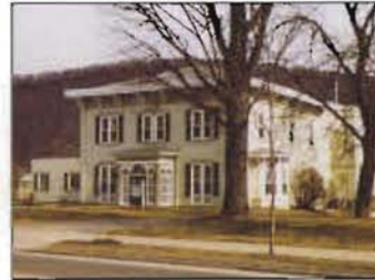
#35 19 Main St. Edward Overton House Italianate Style, 1857.