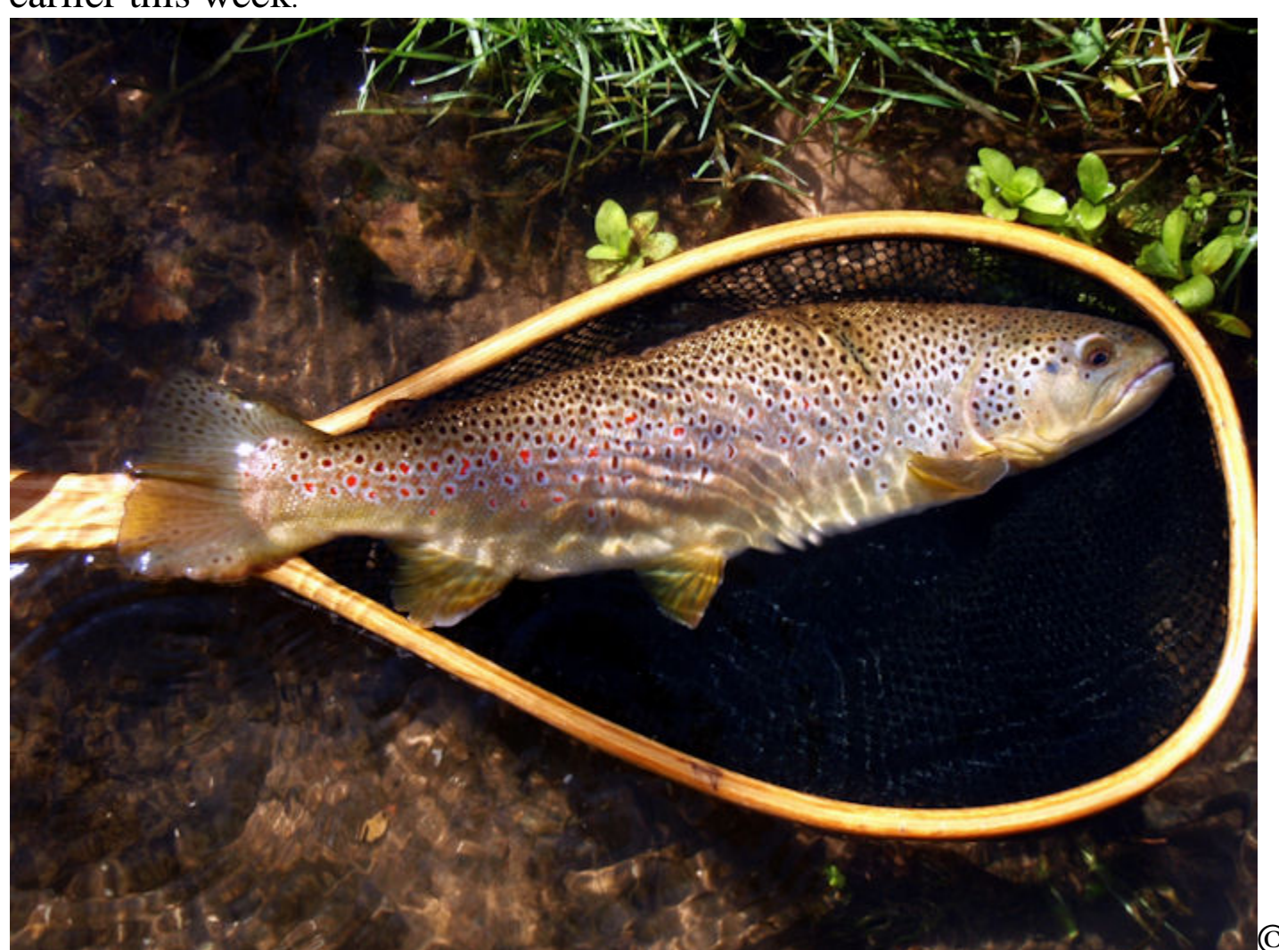
"A Bad Day Fishing Is Still A Great Day"

I thought this photo was worthy of posting. A client of mine caught her earlier this week.