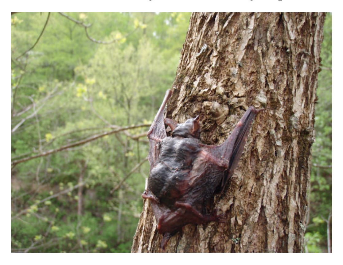
It stayed there for a long time recuperating so I left it alone.