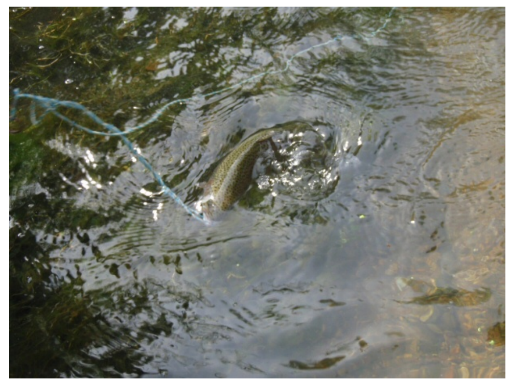
FREE AT LAST!!!

On another entry I made in my Outings Page you will see the result of a Kingfisher getting caught up in fishing line left in a tree hanging over the stream.. NOT pretty!