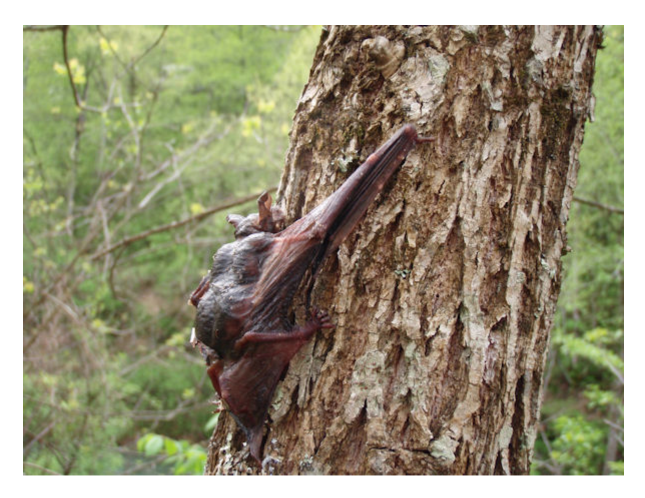
The bat started climbing the tree until it got up about 10 ft.