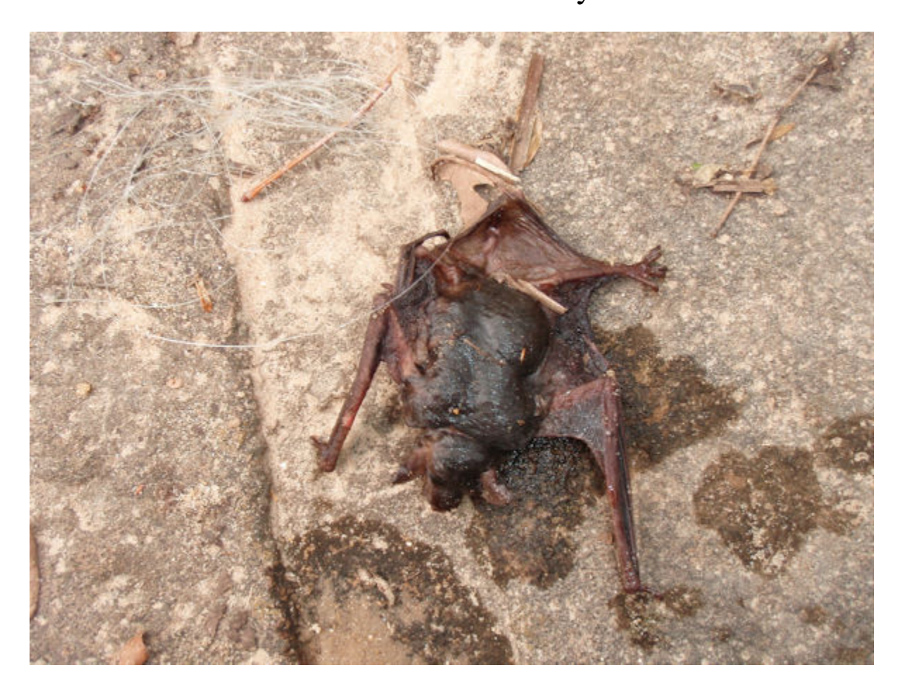
When all the line was cut away I carried it over to a tree.

I carried the bat over to the bank and cut the line off of the wings, the feet and around its neck. It laid on the warm flat rock and started to move a little more each time I cut more line away.