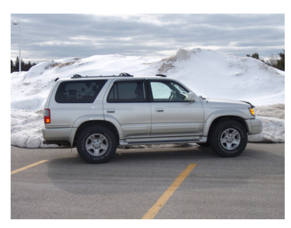
10 feet of snow piled up in a parking

I did get to take some photos that you don't get to see here in Missouri. Conditions that are common place in the Northwoods and that the locals take in stride, are new wonders for me, so if someone saw me taking photos of their "common place conditions" they would have been amused. Lot