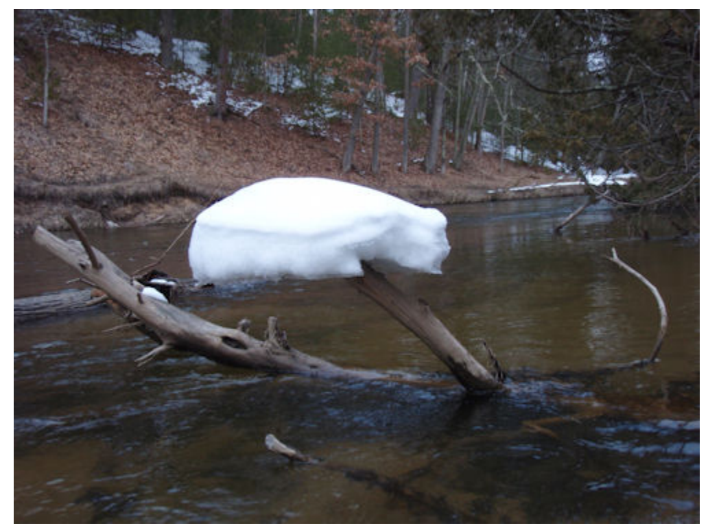
I'm not sure how