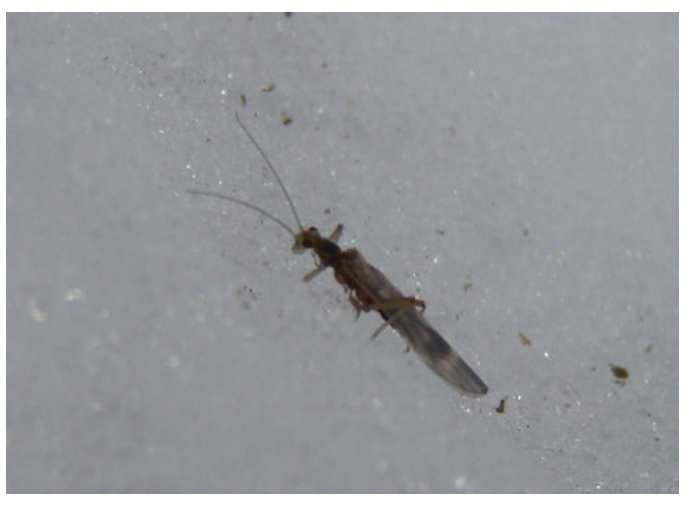
size 14 black stone fly hatch