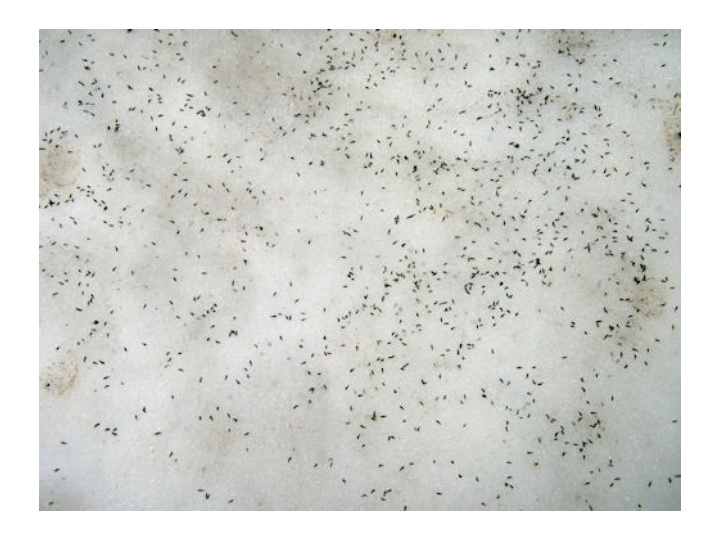
Looks like dirty snow, but they were millions of bugs on the forest floor.