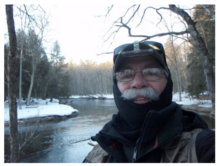
Dress for the season