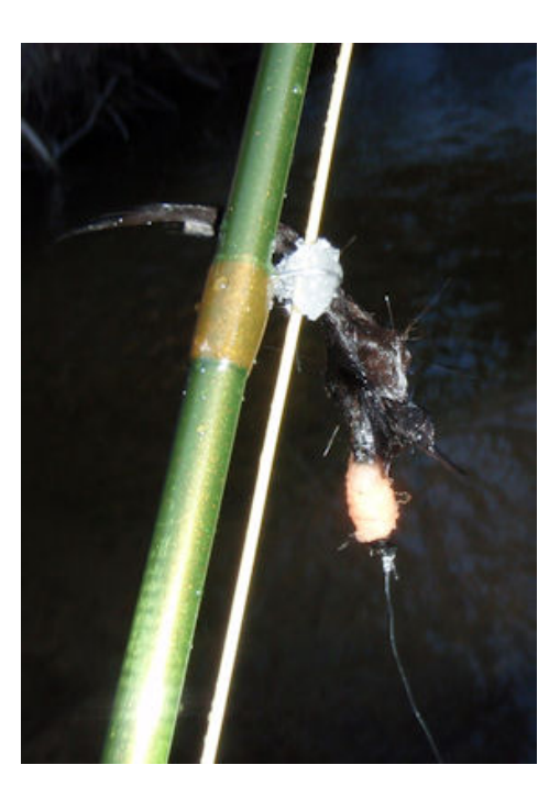
Iced up guides make it hard to cast