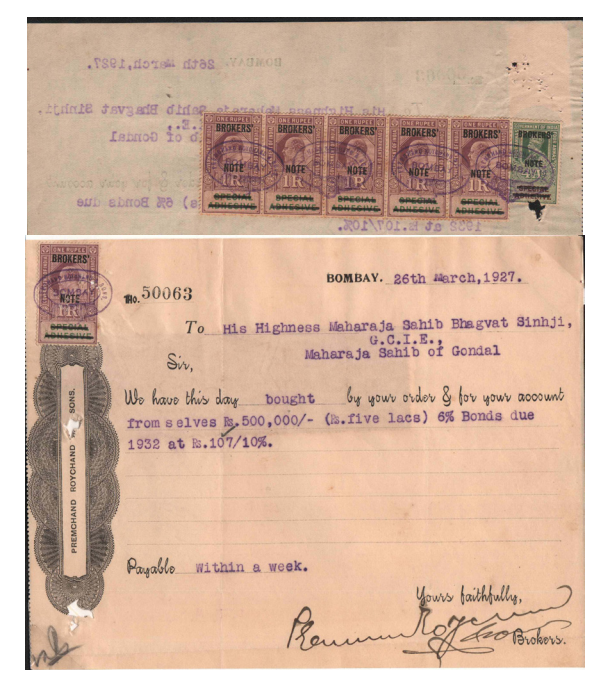
Figure 2. 1927 broker's note for bonds valued at 500,000 rupees

note for the purchase of 500,000 rupees six percent bonds with 6 rupees and 4 annas tax.