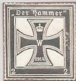
"The Hammer" Poster stamp