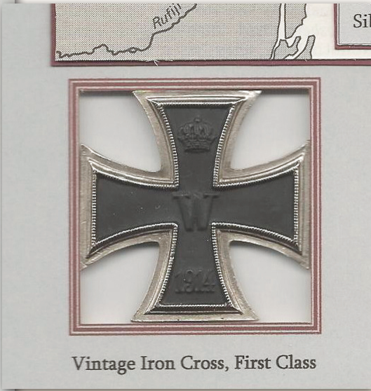
Vintage Iron Cross, First Class