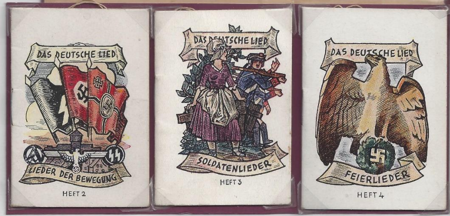
Left to right, Book 2, Nazi songs, Book 3, Soldier songs, Book 4, Celebration songs.