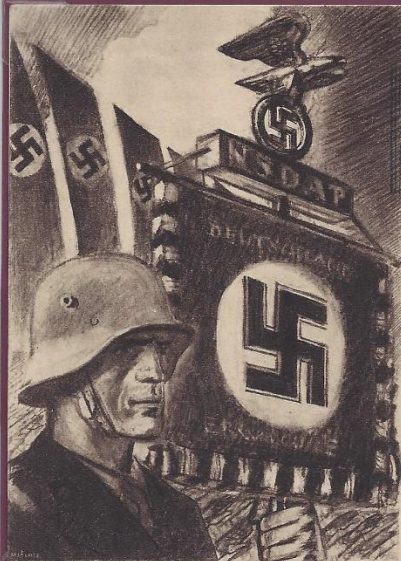
Reichsparteitag Nürnberg 1934

Each year had a theme; 1934 was the "Rally of Unity & Strength". Right, rally day cancel on propaganda postal card.