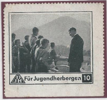
Hitler with HJ musicians circa, 1936. DJH Youth Hostel donation stamp.

HJ band musicians wore Schwalbennester shoulder ornaments. Right, HJ fifer with swallow nest ornaments, Sturm Cigarette card, Dresden, 1933.