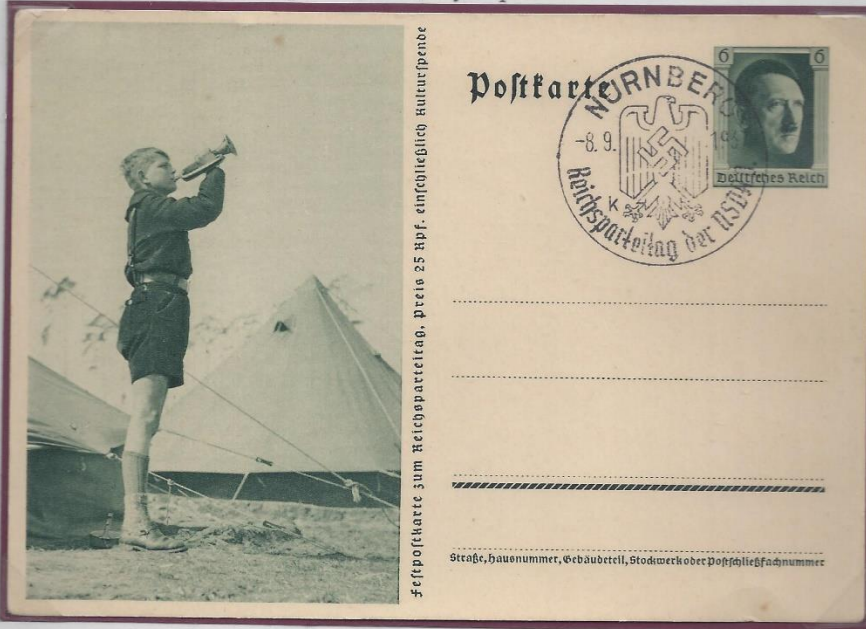
Left, 1937 rally day favor cancel on HI bugler postal card.

The 1937 rally (Rally of Labor) was held on September 8, as usual at the autumn equinox, imbuing these events with a special [Nazi] mystique.