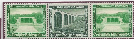
1936 semi-postal issue booklet pane se-tenant stamps of the Nuremberg Memorial.