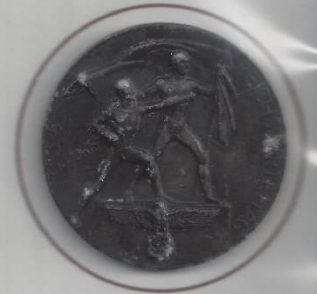
Below, 1938 Party Day tinnie, distributed as a Winter Relief donation token.

Right, rally day cancels on registered letter to Vaihingen (an der Enz), near Stuttgart. Franked with rally day commemorative stamps and a block of Hitler head stamps taken from a souvenir sheet issued for the event.