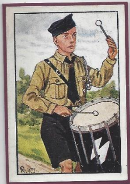
Above, DJ drummer. Sturm Cigarette card, Dresden, 1933.