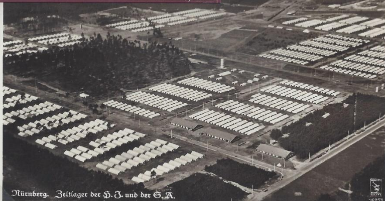
Nürnberg. Zeltlager der H. J. und der S. A.

Divided back card, published by Industrial Photographs, Klinte & Co., Berlin, Negative No.49460.