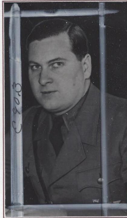
Windowed photo of Schirach in 1935 (behind page, inset to left).

Picture taken in Berlin. Released March 31, 1935; archived April 2, 1935.