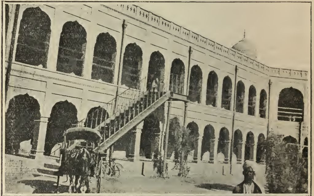
THE SERAI AT QUETTA WHICH WAS TEMPORARILY CONVERTED INTO A REST CAMP FOR OFFICERS—MAY 1919.

5. At the close of the campaign on the 8th August, there were, besides the Base Post Office at Quetta, 9 Field Post Offices at Chaman, Killa Abdulla, Shalabagh and Loralai attached to the several divisional and Brigade Head Quarters and in addition 47 Civil Post Offices converted into Field Post Offices. The total Field Postal establishment on the 8th August, was 6 Officers, 183 Field Postmasters and clerks and 230 followers. The Base Post Office which started with only two clerks and a few packers, had by the end of campaign 16 clerks and 10 followers under a separate Deputy Base Postmaster and was doing all the sorting work for Baluchistan.