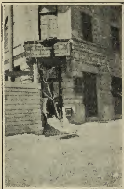
F. P. O. 81, BAKU, CAUCASUS.

After a short stay at Batoum in the Black Sea waiting for steamer left on the 17th May 1919 for Salonica and arrived there on 22nd May passing through the Bosphorous Strait, Constantinople Harbour and the Strait of Dardanelles. The voyage and the scenery was beautiful especially while passing through the Bosphorous and the Golden Horn of Constantinople. The Base Post Office "H" at Salonica was moving to Chanak on the 23rd May 1919. In this area of British Army Post Offices there were Indian F. P. Os. The Army Post Office was dealing with only English mails and British unit and the Indian Post Offices were dealing with only Indian mails and the units of India. Whereas the F. P. Os. of Mesopotamia were serving both the English and Indian mails for the British and Indian troops.