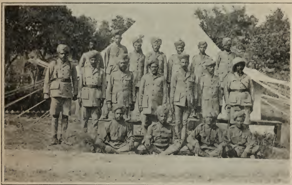
STAFF OF THE BASE POST OFFICE QUETTA.—MAY 1919.