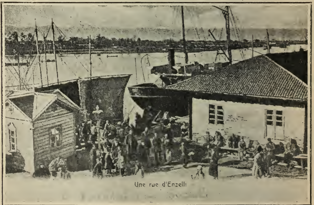
A STREET IN ENZELI ON THE CASPIAN.

The irreproachable good conduct and discipline of the F.P.O. staff were exemplary during those difficult months, between Armistice and demobilisation, when even the best of troops grew sometimes restive. Our staff won the esteem of all with whom they came in contact, British and Caucasians alike, and any success that may have attended the administration of the Field Post Offices in North Persia, Caucasia, and Trans-Caspia is attributable entirely to the devoted labours of these men.