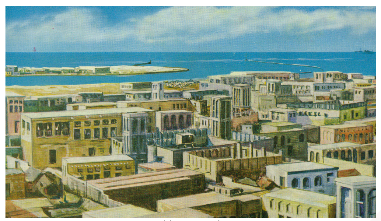
Figure (1): Aerial view of Dubai

After a few decades from the migration of Al Bu Falasah tribes from Abu Dhabi to Dubai, it became the best model for the Trucial Coast cities in terms of growth and development in tandem with the booming pearl trade. Since the late 19th century, it has become a politically and economically stable place that attracts Bedouins and traders. This is what made the Political Resident Ross describe it in 1878 as "an important port on the Arabian coast." This description seems to have been the result of Dubai's emergence as a pearl-fishing center in the region. Its port in the 1880s was at the forefront of the pearl trade compared to the other emirates' ports, as it had 450 diving vessels with 8,000 people working on them.