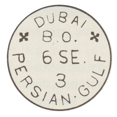
Figure (6): The First Dubai Branch Post Office Cancellation

in Dubai as a Postmaster, as an interim measure, with a monthly salary of 15 Indian rupees. The Assistant Secretary to the Government of India in the Foreign Department indeed sent a letter on July 7, 1909, to the Political Resident in Bushehr, Major P. Z. Cox, stating: