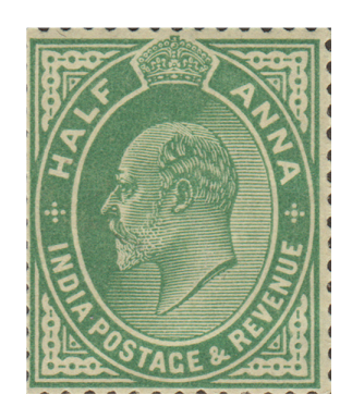
Figure (7): King Edward VII Indian Stamp

Only one cover recorded sent to Dubai during the period