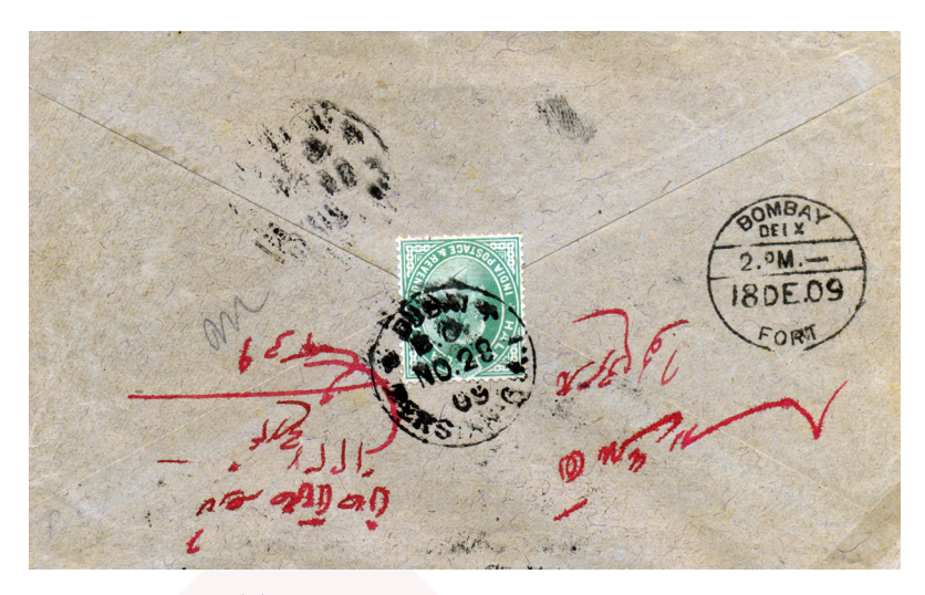
Figure (5): A 1909 cover sent from Dubai Post Office.

trouble of making its delivery without any remuneration from the postal authorities till this time. We do not know how long we should conduct this work and expose ourselves to the frequent botheration of the public enquires regarding the arrival of their letters and the like without any return. We hope you will kindly place the matter before His Britannic Majesty's Consul-General, and request him to arrange through the postal authorities to give us some reasonable remuneration to enable us to appoint a separate man for the work on our behalf and thus to free ourselves from the troubles and botheration."