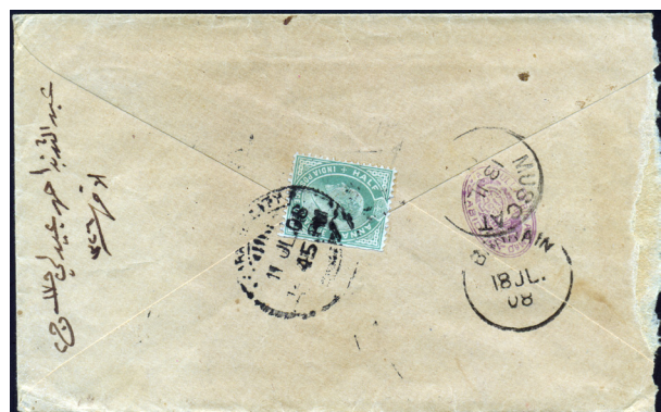
Figure (4): A pre Post Office cover sent from Bombay to Dubai via Bahrain, 1908.

post office merchants have to send their letters and shipping documents through passengers or their friends at other ports, the result being that they reach very irregularly or sometimes not reach at all. You are well aware that the very first and the most important factor in trade is the postal arrangement without which it is almost impossible to develop it to any great extent.