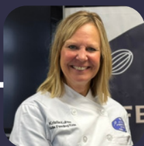
Waverly, IA July 14-16, 2026