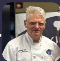
New Kent, VA July 28-30, 2026