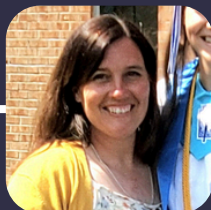
Unionville, MO June 9-11, 2026