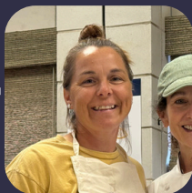
Salina, KS June 2-4, 2026