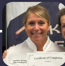
Reeds Spring, MO June 2-4, 2026