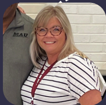
Springfield, MO June 24-26, 2026

Kids Feeding Kids supports grades 7-12 FCS/CTE foods classrooms by fully funding ingredients & supplies for skills-based culinary projects. Students explore the root causes of food insecurity, learn practical ways to prevent food waste, and prepare nutritious meals for local families and earn community service hours. To learn more, visit kidsfeedingkids.org or watch this video of students and educators as they reflect on their Kids Feeding Kids Experience.