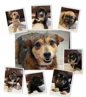
Dwight . Michael . Nellie Breezy Pam . Angela . Jim . Stanley

Giving Saves Lives! Support is vital to make a lasting difference to animals' lives. Tax deductible gifts, with all funds received going directly to the care of rescue dogs, help to save animals from shelters and give them the chance at a loving home that they deserve. Help be their voice and please consider making a donation of any amount today!