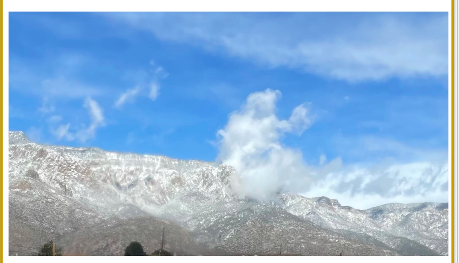
Spring snow dusts the Sandias