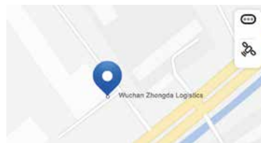
Products and logistics(TANGSHAN YUFENGKU)

1 slitting/slitting, cross-cutting equipment, 1.0-12 thick slitting, arbitrary width and large volume small Volume functions. Cutting plate raw materials are strictly made of high-quality raw materials of Anfeng, Zongheng, YS and other manufacturers Control the quality of raw materials and finished products.