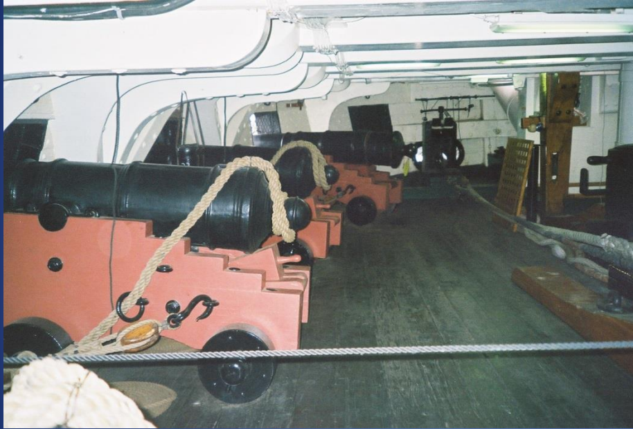
A view of the USS Constitution's gun deck (below the main deck)