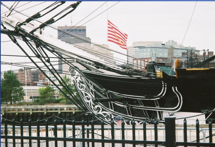
The Bow (front) of the USS Constitution