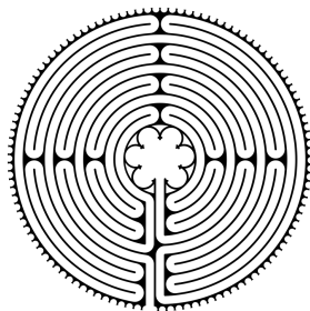
The Labyrinth in Chartres Cathedral

Since before the medieval ages, labyrinths were common in Christian manuscripts long before becoming walkable large scale labyrinths in cathedrals, especially in France and Italy. Turf labyrinths were found in Great Britain on village greens, today only 8 are left.