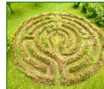
The full size version of this Labyrinth at The Northumbria Community Acton, Northumberland

See if there is any path of pain I'm walking on, and lead me back to your glorious, everlasting way— the path that brings me back to you