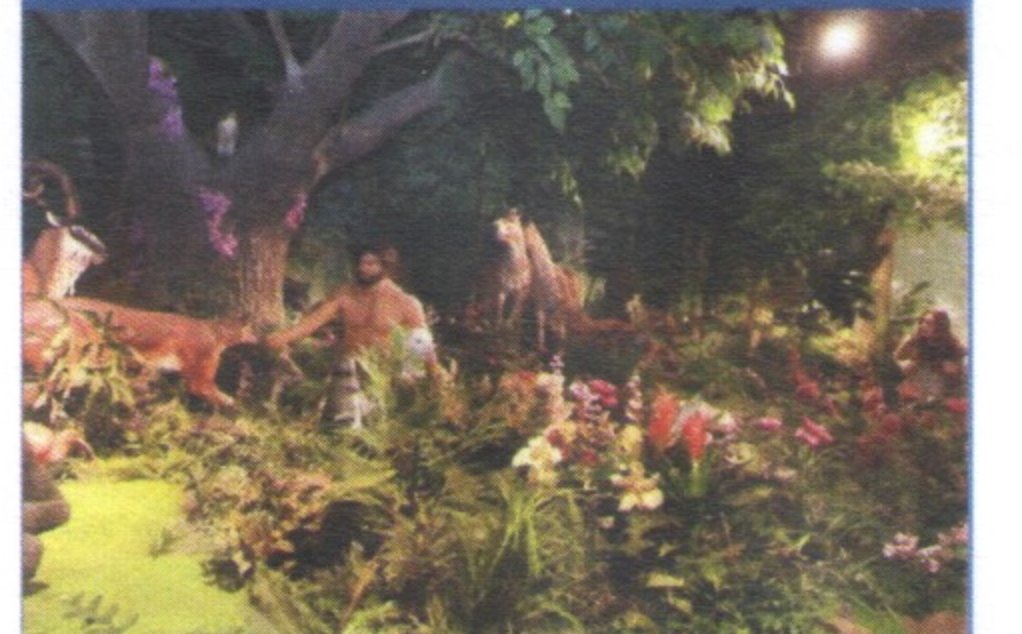
Visit to the Amazing Creation Museum!