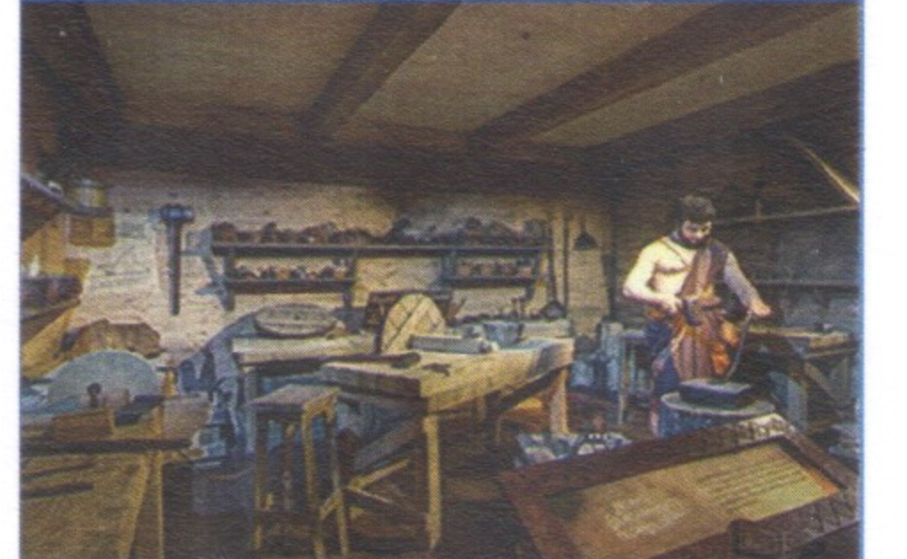
View from Inside the Ark Encounter