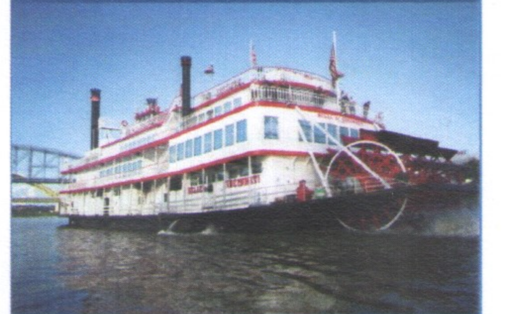
Enjoy a BB Riverboats Sightseeing Cruise