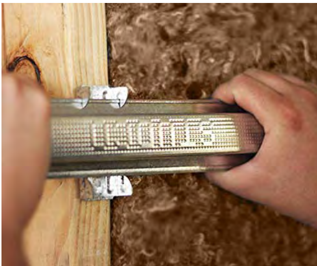
Resilmount A237R™ used to reduce airborne sound and structure-borne vibration in walls and ceilings.

Resilmount A237R is an engineered, patented resilient sound isolation clip for reducing airborne sound and structure borne vibration transfer. Used in wood, steel and concrete wall and ceiling assemblies they ensure superior transmission loss and high STC ratings.