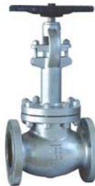
Cryogenic Globe Valve