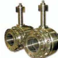
Cryogenic Ball Valve