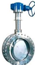
Cryogenic Butterfly Valve