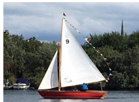
Seabird Half Rater 125 year old - Cormorant Owned by the Read Family