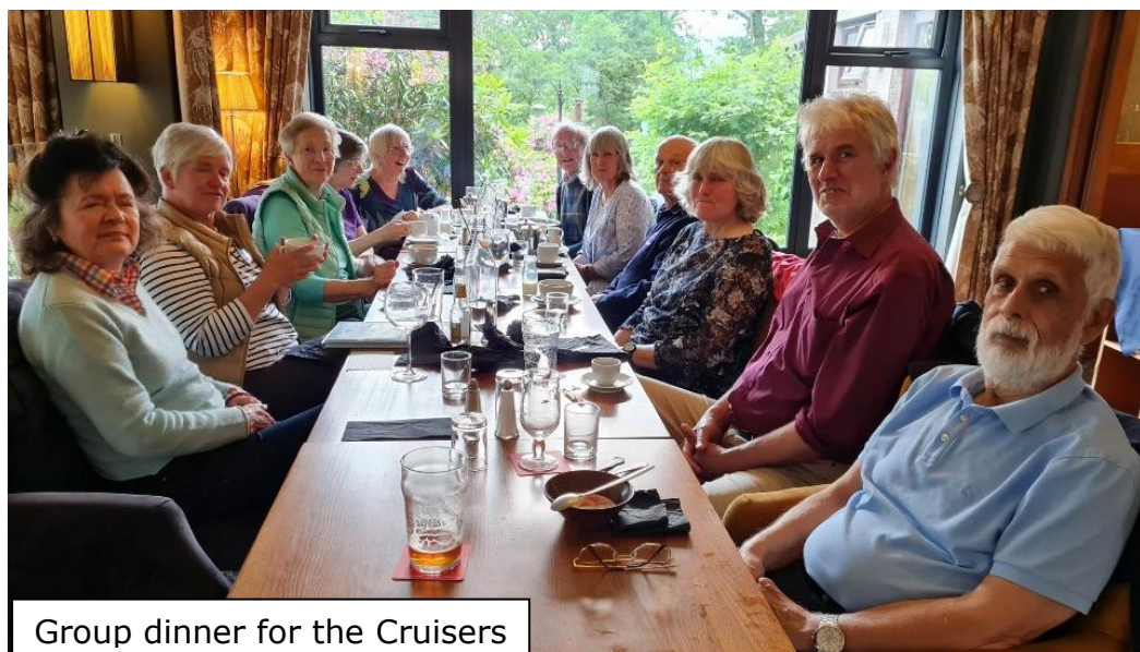
Group dinner for the Cruisers