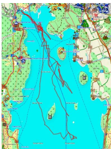
Tracking the trip.