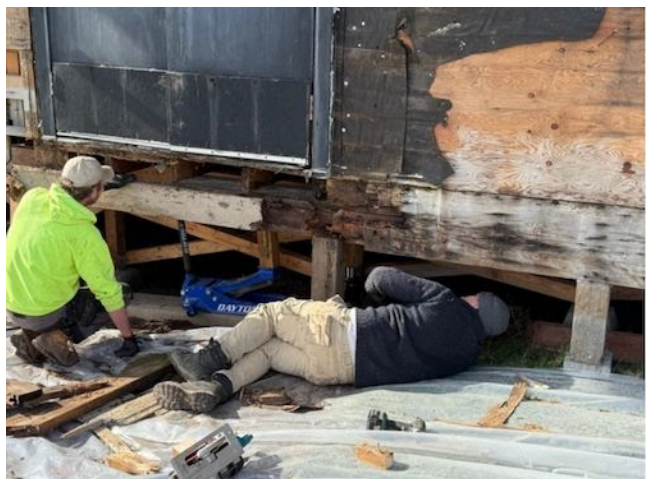
Addressing the rot in the south wall