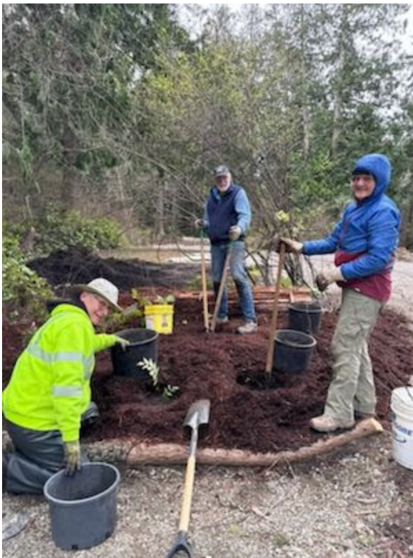
450 plants is a lot!