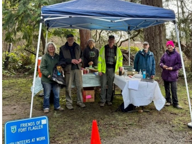
Hot drinks and snacks appreciated on this cold day in February

Now we need to keep all the newly planted plants, watered through the coming months so they have the best chance of survival. Please sign up for one or more watering sessions using the button below.