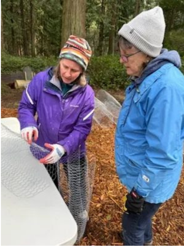
Deer don't stand a chance with these cages for the plants!

The Upper Campground opened on schedule May 1st , thanks to the incredible team of FoFF volunteers (32 of them!) who put in hundreds of hours with park staff to ready reconfigured campground. As previously described the new road cutting through the campground resulted in a major reconfiguration of campsites and a LOT of disturbed ground.