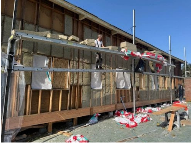
Reframed insulation going up

Once the contractor's team has completed their work, FoFF will take over on the interior, installing new lighting and a sound system, refinishing floors and getting the space ready for use. We were successful in advocating for funding the project in the State capital budget, selling the idea of a partnership between WSP and FoFF. First step: raising the money we'll need for our part of the bargain.