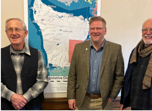
Congratulations to Senator Chapman for being appointed chair of Natural Resources Committee!