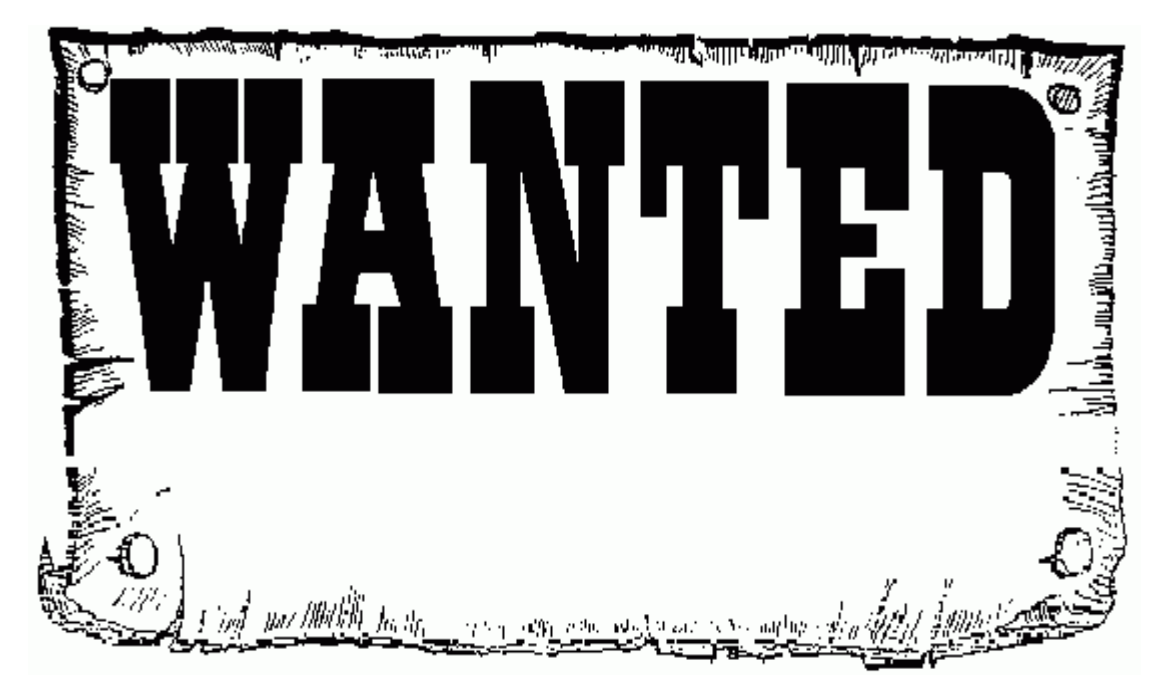
CALL FOR POSTERS

Northeast Association for Clinical Microbiology and Infectious Disease Northeast Branch American Society for Microbiology