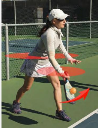
Figure 4-3 (legal serve)

(Photos and graphics courtesy of Steve Taylor, Digital Spatula)