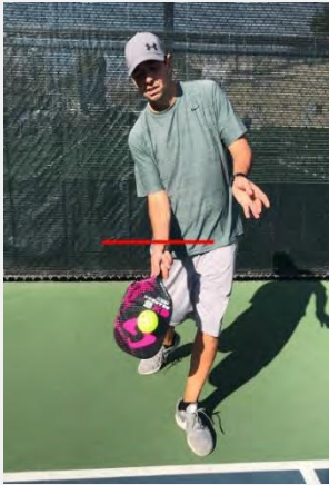
Figure 4-1 (legal serve)