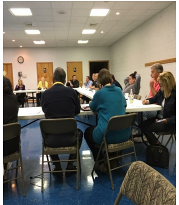
Looking deep in thought