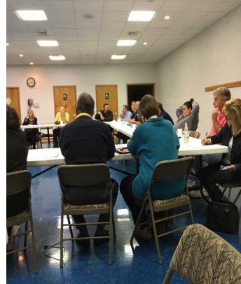
Looking deep in thought

WVAS Scholarships and WVAS Membership to Sanitarian Trainees