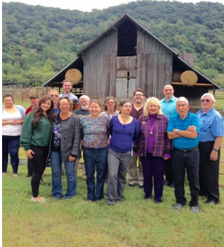
Don't they look like a post-card?