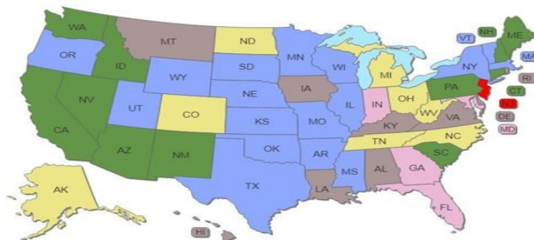
State-by-State 1 Review of Raw Milk Laws