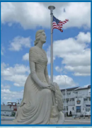
Lady of the Sea

ROUTES: The walk begins and ends at the Hampton Beach State Park Pavilion and is a total of 2 miles (or less, if you choose). Turn-around point is the Lady of the Sea Monument, then return to the Park for picnic lunch.