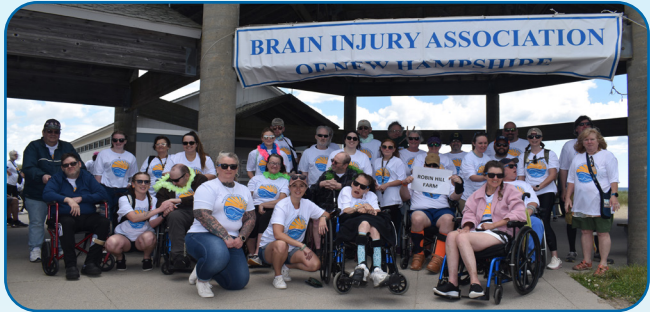
2024 First Place Team - Robin Hill Farm Team with Most Walkers

MAKE CHECKS PAYABLE TO BIANH; SEND TO 52 PLEASANT STREET, CONCORD, NH 03301 TOLL FREE: 800-773-8400 (NEW HAMPSHIRE ONLY) PHONE: 603-225-8400 FAX: 603-228-6749