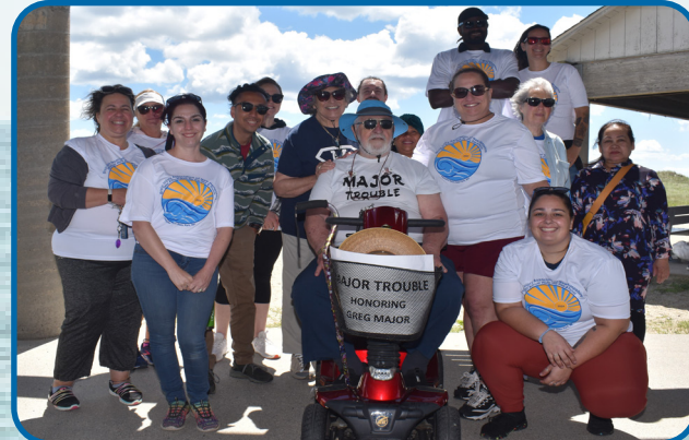
2024 First Place Team - Major Trouble - Most Money Raised