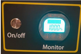
(SOC) Screen will Pulsate when charging. Draw/Voltage/Charge Rate

The Blue tooth Status gauge is like a fuel gauge, it can show full but will still be taking on charge like a fuel gauge shows full when it still has 5-10 litres to go in, the app is only an indicator of status such as charge and discharge. The SOC screen can show 90% for example and the App shows 100%. However, the unit is still taking on charge on the status screen. Once full, both SOC and App will be calibrated within a couple of percent.