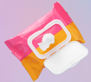
BODY WIPES & MAKE UP WIPES