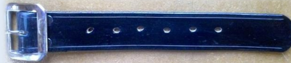
CARTRIDGE BELT LENGTH EXTENDER