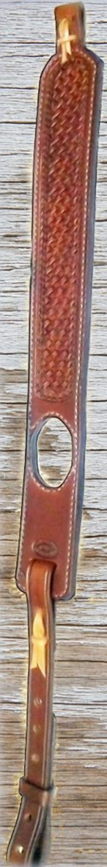
RIFLE SLING WITH THUMBHOLE FOR EASY CARRY