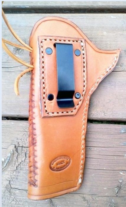
.22 CAL HOLSTER - AVAILABLE WITH BELT CLIP